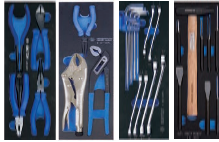
9-40104GPV 9-40113GPV 9-90135MRV 9-90118PRV