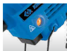
• Automatic temperature control turns off at 180° and turns on under 160°