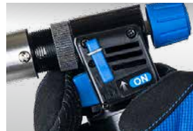
• Press the ignition button