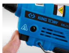
• Press the ignition button and wait 2-3 min (Make sure the indicator on )