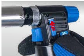
• Push the safety latch up