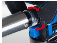
• Turn the air flow control switch to change the fire type