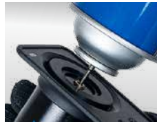
• Refilling gas