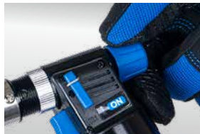
• Turn the gas flow control switch counter-clockwise