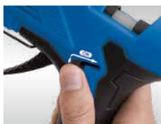
• Turn the gas switch on