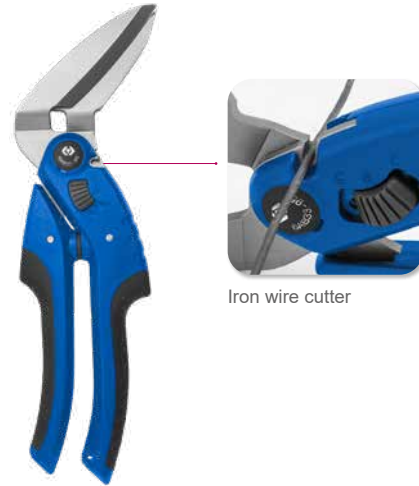
Iron wire cutter