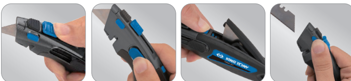
• Auto return butto • Auto lock button • 2 blades in storage • Blade replace button