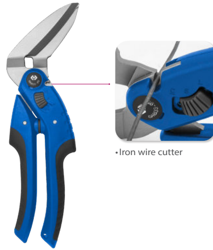
• Iron wire cutter