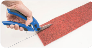
• Big angle design between blades and the handles of the scissors