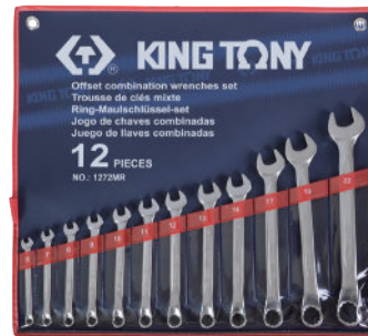
► MR / SR : Nylon pouch bag