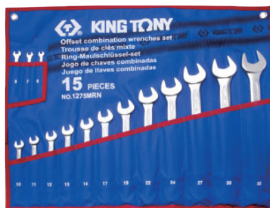
► MRN / SRN : Teton pouch bag