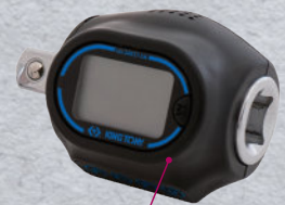
Torque Angle Adapter