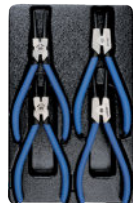
9-42114GP #2 P.105