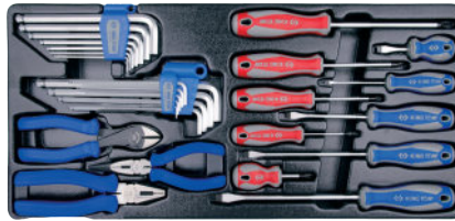
9-90129CR #3 P.106