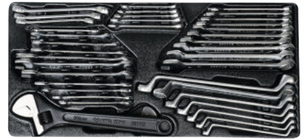
9-90138CR #3 P.106