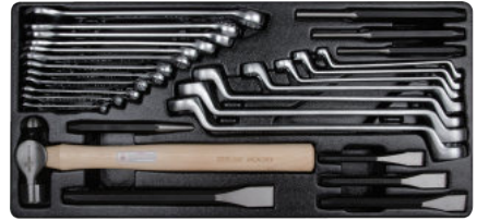
9-90128SR #3 P.105