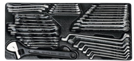
9-90138CR #3 P.106