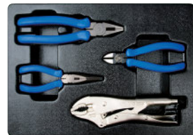
9-42144GP #4 P.114