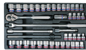
4042CR #476 x 282mm P.190