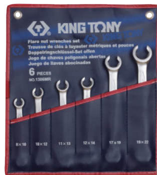
► MR / SR : Nylon pouch bag