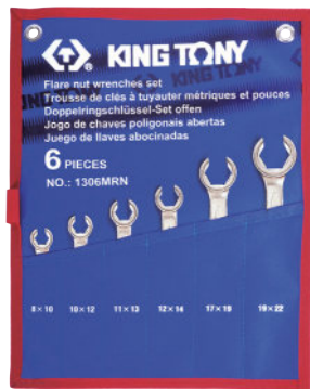
► MRN / SRN : Teton pouch bag