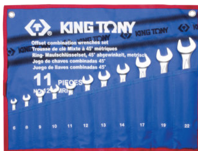
► MRN / SRN : Teton pouch bag