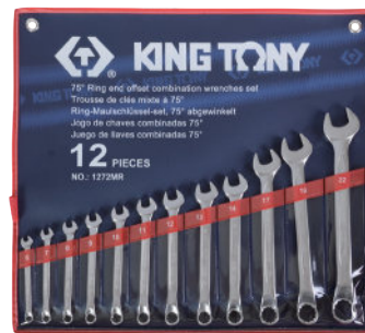
► MR / SR : Nylon pouch bag