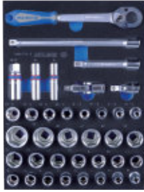
9-4537MRV #9 P.73