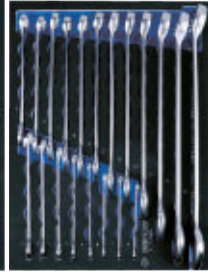
9-1220MRV #9 P.74