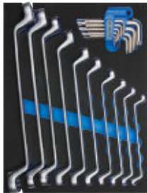
9-90119MRV #9 P.74