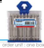
order unit : one box