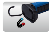
• Starke Magnetbasis + 90° Haken