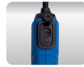
• Port USB + indicateur de batterie