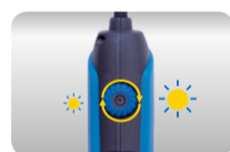
• Regulador de luminosidad