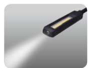
• LED SMD

Batterie : Li-ion, 3.7V, 2600mAh Zubehör : USB-Ladekabel 1m und USB-Ladegerät 5V-1A Material : PA + TPE Gehäuse