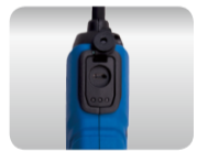
• Puerto USB + indicador de batería