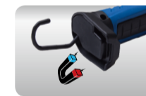
• 90° draaibare haak en magnetische voet