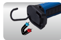
• Gancho giratorio de 90° y base magnética