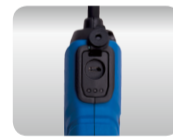
• USB Oplader Poort + batterij indicator