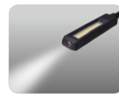
• LED SMD

Batterie : Li-ion, 3.7V, 2600mAh Accessoires : Câble de chargement USB 1m et chargeur USB 5V 1A Matériau : Corps en PA + TPE