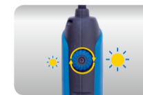
• Variateur de luminosité