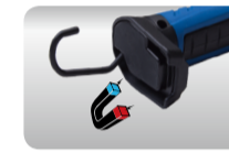
• Crochet pivotant à 90° et base magnétique